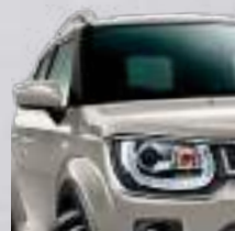
Caravan Ivory Pearl Metallic (ZYL) LTD only