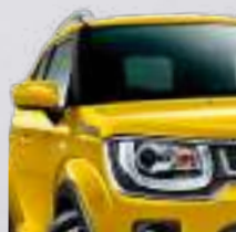
Rush Yellow Metallic (ZYK)