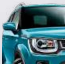
Neon Blue Metallic (ZWC)