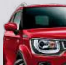
Fervent Red (ZNB) LTD only