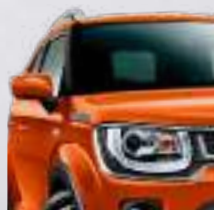
Flame Orange Pearl (ZWD)