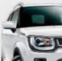
White Pearl (ZVR)