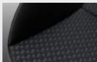
Silver interior accents.